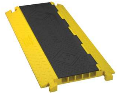
Bumble Bee with T-bone Connector*